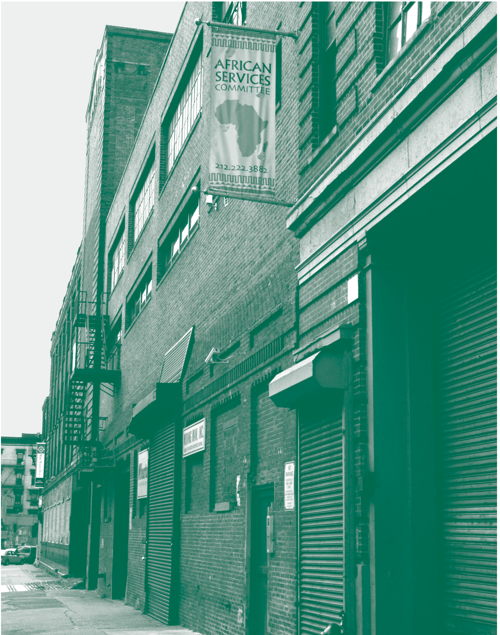
Establishing a strong foundation in Harlem with the expansion of our office space at 429 West 127th Street in New York City.