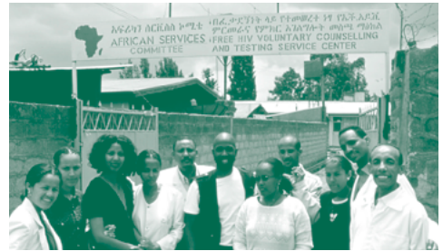
The staff of African Services' Shola Market testing center in Addis Ababa.

Broadening AIDS care and support services at the community level in Ethiopia is vital. With the support of Becton Dickinson, we have integrated CD4 testing at our Shola center and are providing referrals to care through a growing network of adult and pediatric AIDS treatment sites.