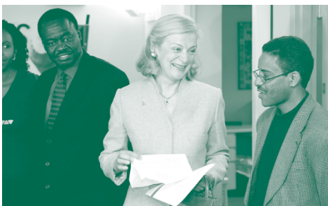
Mrs. Kofi Annan visits African Services Committee on World AIDS Day.